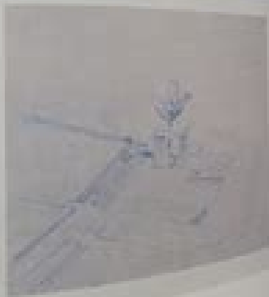
59. Open Hand Monument, aerial perspective sketch