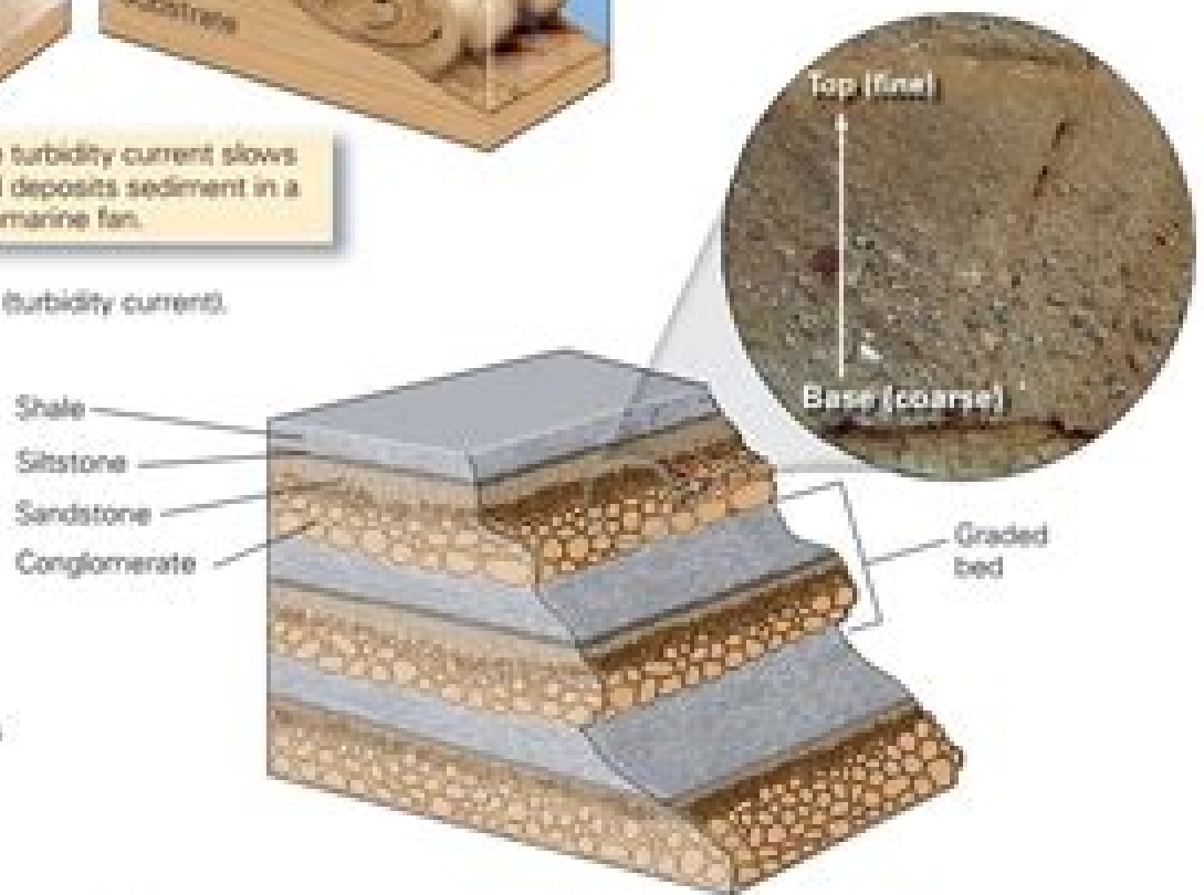
(c) As the process repeats, a succession of graded beds accumulates.