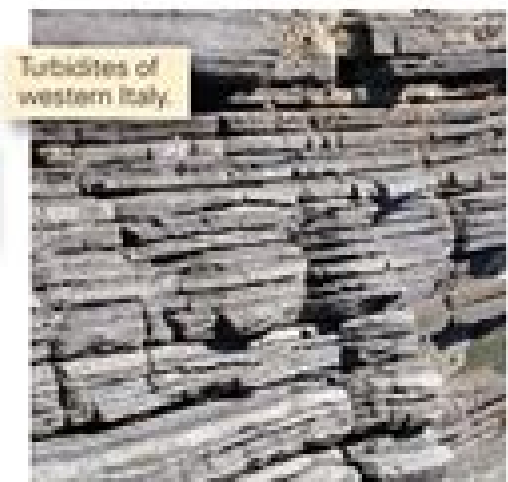
(a) An earthquake or storm triggers an underwater avalanche (turbidity current).