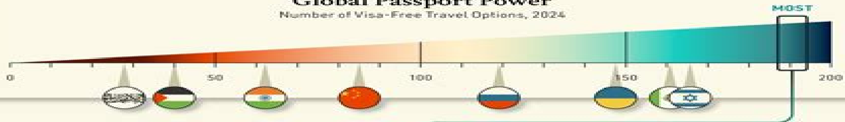
Global Passport Power Number of Visa-Free Travel Options, 2024

Spanning 227 different travel destinations, who takes the top spot, based on the 2024 Henley Passport Index?