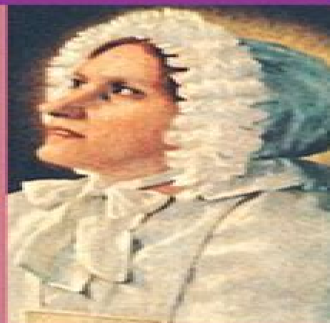
Bl. Anna Maria Taigi (1769-1837), wife, mother of seven, mystic and counselor of Popes and Saints.