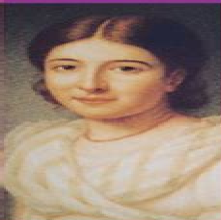
Ven. Pauline Jaricot (1799-1862), foundress of the Society for the Propagation of the Faith.

250 Canonized and Beatified Lay Men, Women and Children