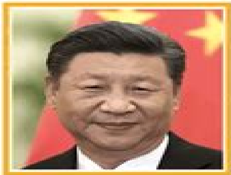
Paramount Leader, Xi Jinping