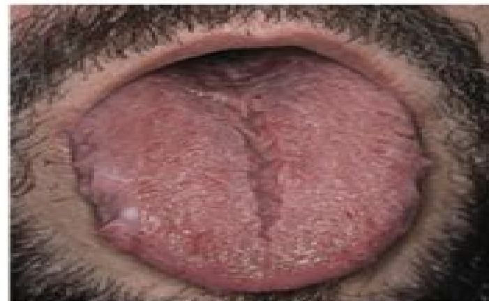
Fig. 89: ▷ Shape of the tongue body