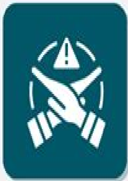
Limited Service Availability