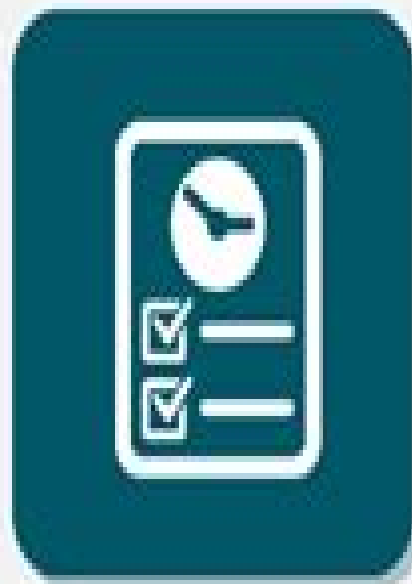
Waiting Lists for Services