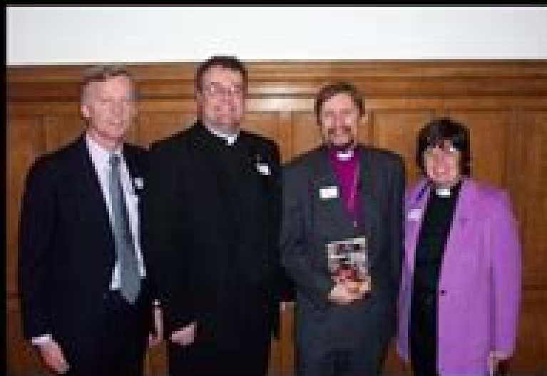
Some of the working group