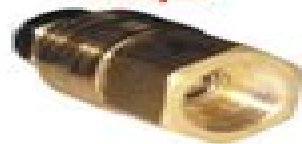
OLS - 272 Adapter