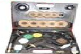
OLS - 270 Square Drive Ratchet