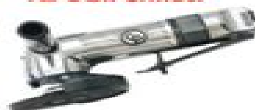
OLS - 268 Air Disk Grinder