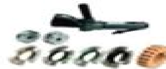
OLS - 269 MBX Kit