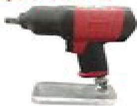
OLS - 267 Impact Wrench