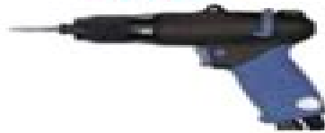
OLS - 260 Air Drill