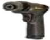
OLS - 259 Air Hammer