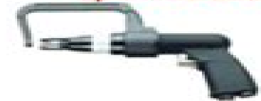
OLS - 266 Spot Weld Cutter