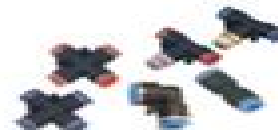
OLS - 277 Pneumatic Connector