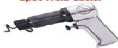
OLS - 261 Spot Weld Cutter