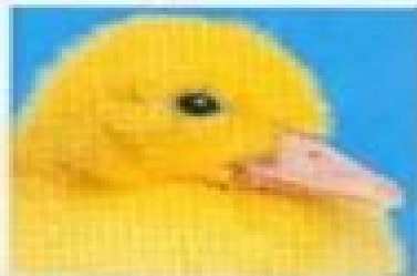
el patito duckling