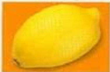
el limón lemon