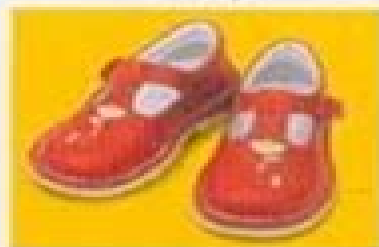
los zapatos shoes