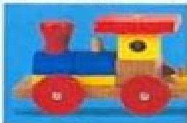
el tren train