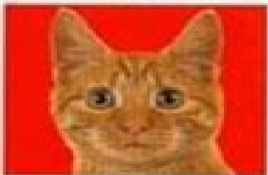
el gato cat