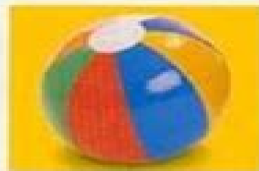
la pelota ball