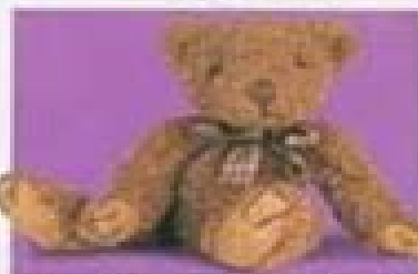
el osito de peluche teddy bear