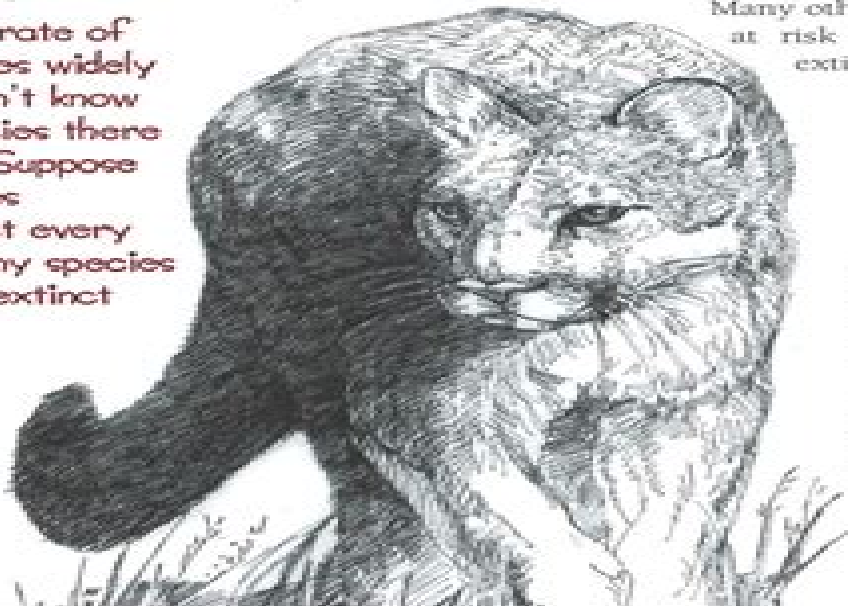
The eastern cougar is now endangered in Ontario.

Dinosaurs as large as a 6-story building and as small as chickens roamed the Earth for millions of years — much longer than humans. Nobody really knows why dinosaurs became extinct. A species that is extinct no longer lives anywhere on Earth. In North America alone, at least 500 species of plants and animals have become extinct since the 1500s. The great auk, the passenger pigeon and the sea mink are just a few of the creatures that are no longer found in North America, or anywhere else. They are extinct.