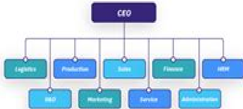
1. Functional Organizational Design