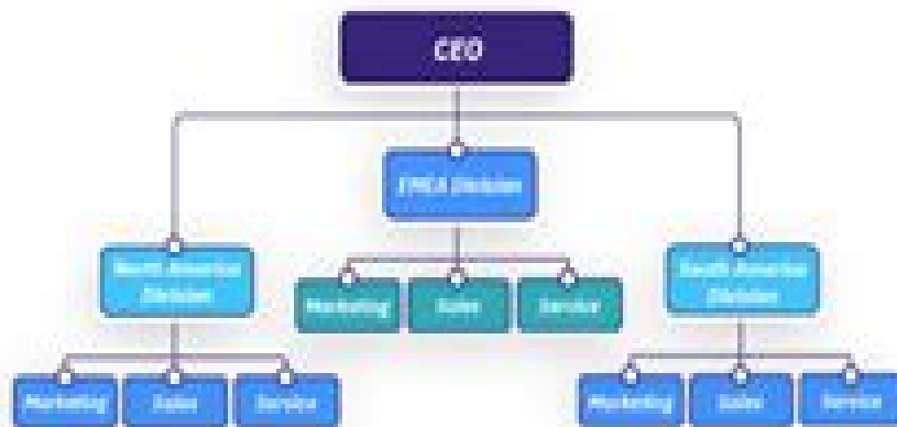
3. Geography-Based Organizational Design