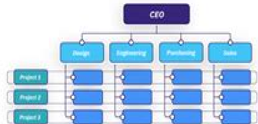
4. Matrix Organization