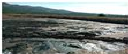
Olive mill waste sludge