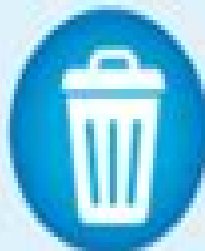
Municipal Solid Waste