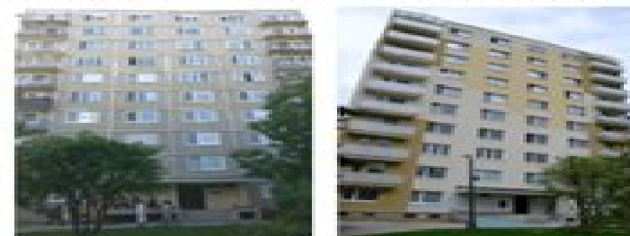
Fig. 2. The evaluated dwelling before and after refurbishment