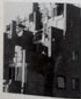
Fig. 12. Showing the exterior the apartment building under construction. The first floor features a private entrance. Fig. 14. The structure of the building is a steel frame consisting of a series of vertical and horizontal members. The structure is a steel frame consisting of a series of vertical and horizontal members.