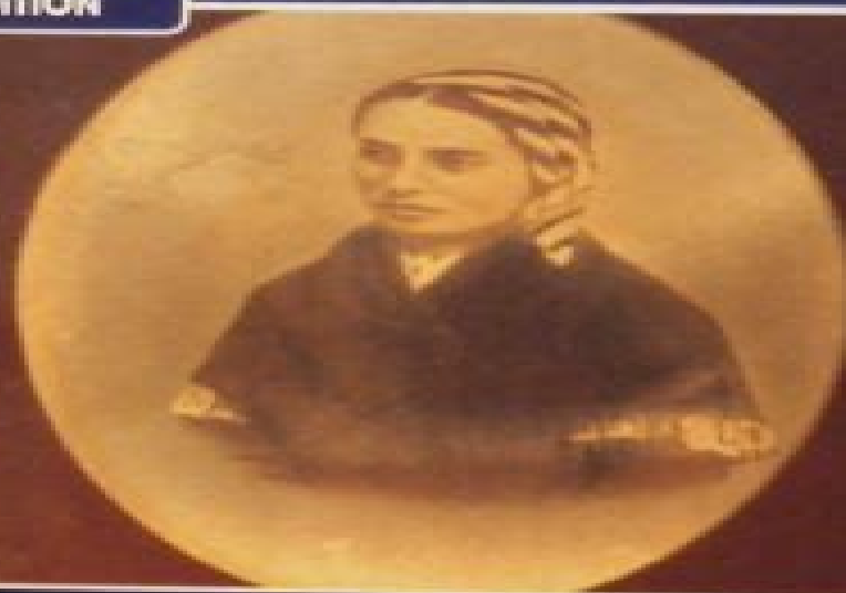
BERNADETTE SOUBIROUS the life and the apparitions