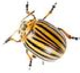
Colorado potato Beetle