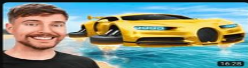
$1 Vs $100,000,000 Car! MrBeast 10M views · 2 hours ago