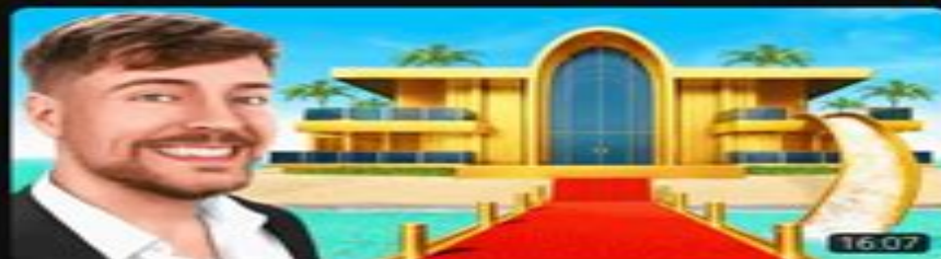
$1 vs $250,000 Vacation! MrBeast 150M views · 1 month ago