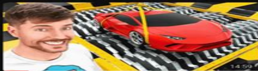
Lamborghini Vs World's Largest Shredder MrBeast 99M views · 2 weeks ago