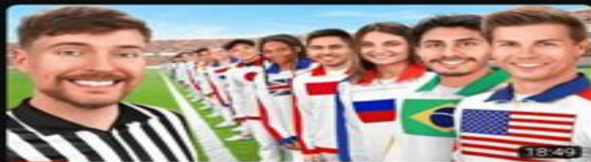
Every Country On Earth Fights For $250,000! MrBeast 120M views · 4 weeks ago