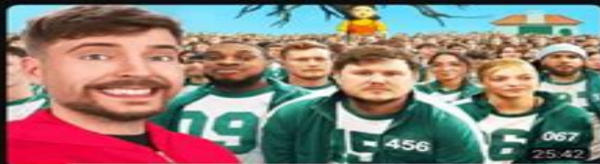
$456,000 Squid Game In Real Life! 407M views · 1 year ago