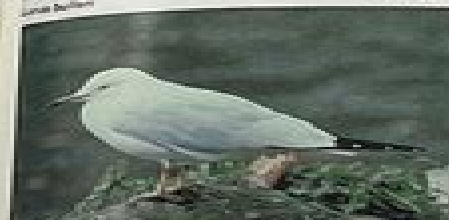
(389) Black-billed Gull Larus bulleri