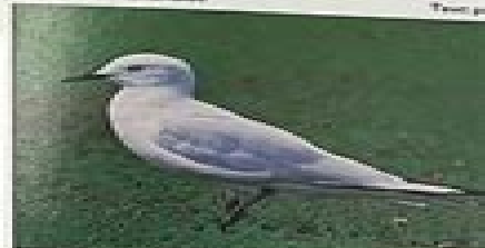
(388) Black-billed Gull Larus bulleri