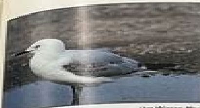
(385) Silver Gull Larus argentatus