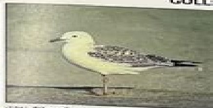
(386) Silver Gull Larus argentatus