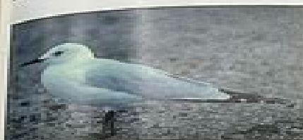
(387) Black-billed Gull Larus bulleri