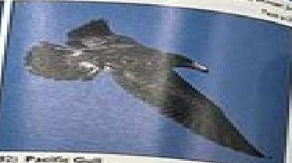
(382) Pacific Gull Larus pacificus