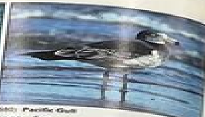
(Adult Summer, Jay) Text p.237 (380) Pacific Gull Larus pacificus