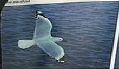
(383) Silver Gull Larus argentatus