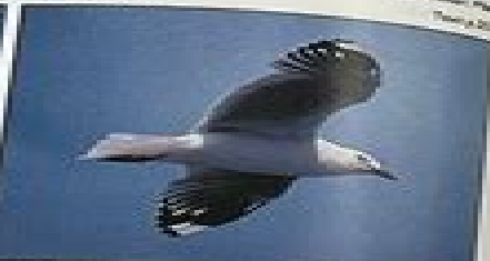
(384) Silver Gull Larus argentatus