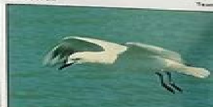
(390) Black-billed Gull Larus bulleri