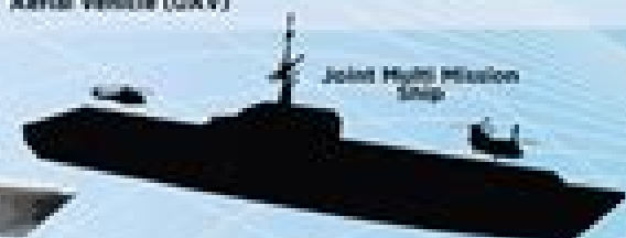
Joint Multi Mission Ship