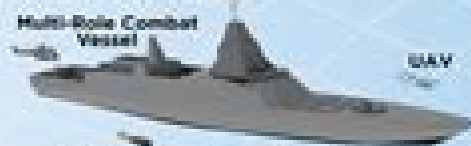
Multi-Role Combat Vessel