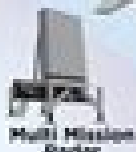
Multi Mission Radar