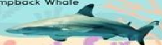
Blacktip Reef Shark