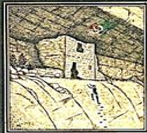
ANCIENT CLIFF-DWELLERS A.D. 800-1200