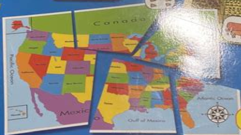
United States Map Puzzle