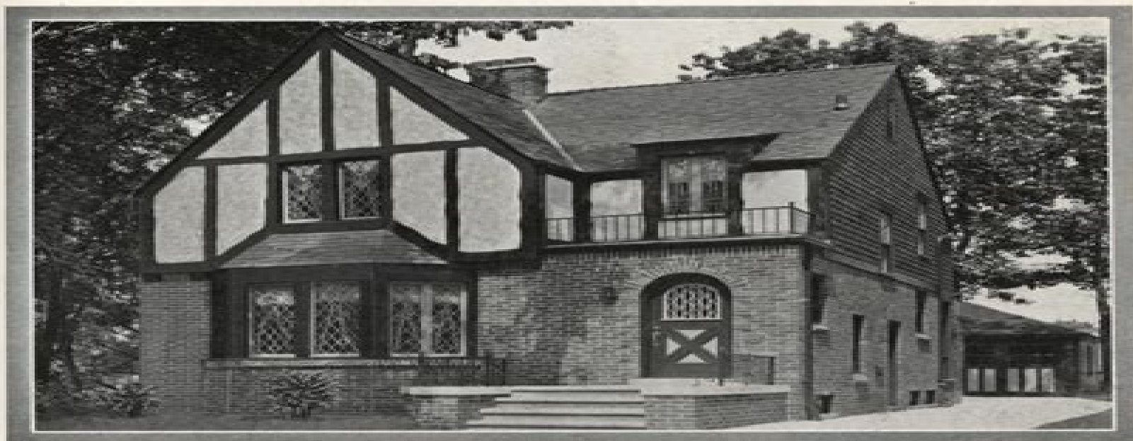
SIX ROOMS AND DINING NOOK, 26 X 30 FT.