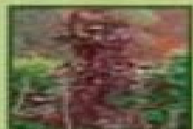
PRACTICAL TIPS AND HINTS