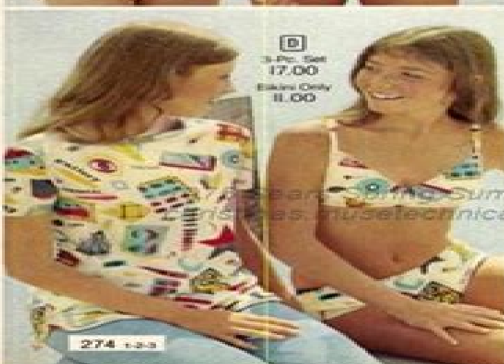
D 3-Pc. Set 17.00 Bikini Only 11.00