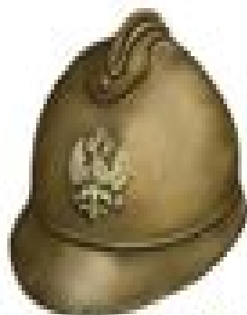
Adrian Helm Mle 1915