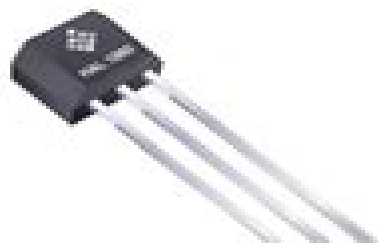
Hall Effect Magnetic Sensor