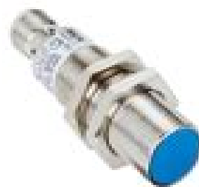
Magnetic Proximity Sensor