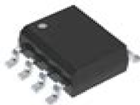
Magnetoresistive Element sensor