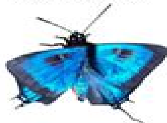
Great Purple Hairstreak