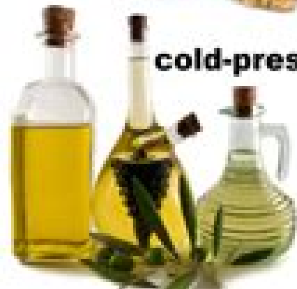
cold-pressed olive oil