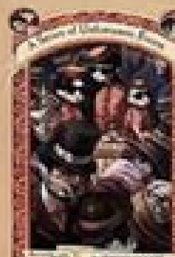
«THE FIMULTIMATE PERIL»