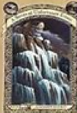
«THE SLIPPERY SLOPE»