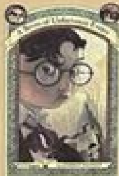
«THE MISERABLE MULL»