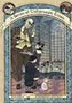
«THE AUSTERE ACADEMY»