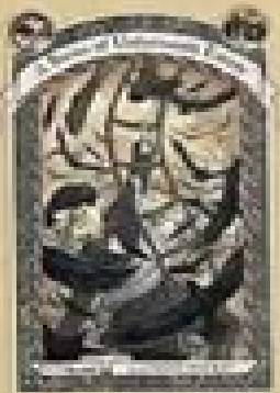
«THE WIDE VILLAGE»