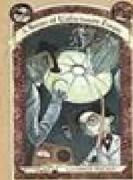
«THE HOSTILE HOSTESS»