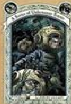
«THE GRIM GASTRO»