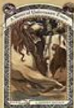
«THE CANNIBAL'S COBERT»