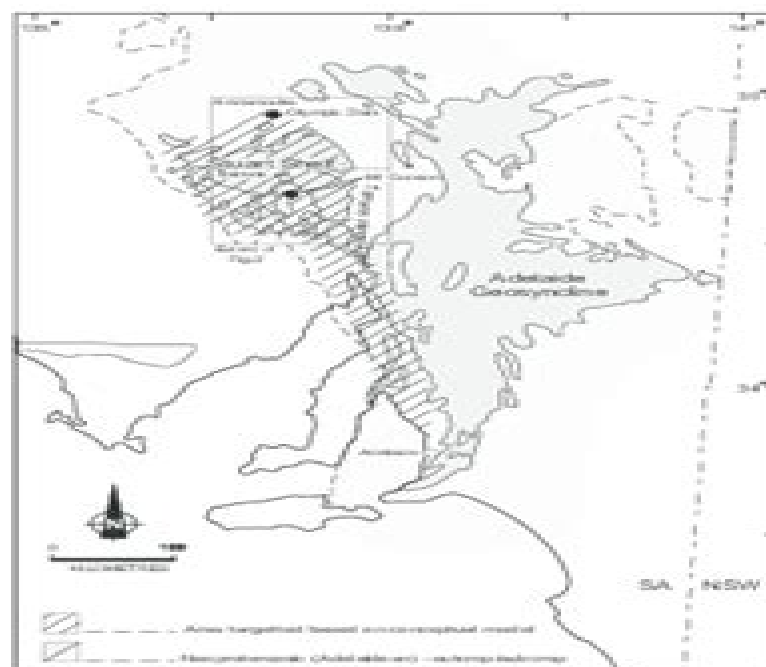
Fig.1. Map of eastern South Australia showing the regions defined during initial targeting leading to discovery of the Olympic Dam deposit. Geology from Prosser (1993). Also shown are the positions of the Andamooka and Torrens 1:250,000 map sheets.

spacing. These data detected an apparent resistivity low, restricted to the southern and central sections of the deposit. The cause of this low is interpreted as being porous, matrix-rich, haematitic breccias, in which the dominant form of haematite is a black crystalline variety. Pore fluids are highly saline, with an apparent resistivity of between 0.1 and 0.05 \Omega\text{m} . The source of a positive phase-angle response is not well understood, but it has a close spatial relationship with the extent of the haematite-rich breccias, whether these breccias are mineralised or not. This interpretation is not consistent with the results of downhole logging using relatively small geometric survey parameters. This inconsistency reflects the difficulty in trying to reconcile small-scale physical property measurements with the larger scale surface measurements, for such a complex, inhomogeneous mineralised environment.