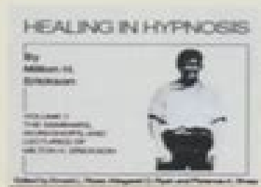
Healing in Hypnosis

Includes 4 Complete Books, Updates & Audio