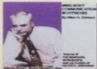
Mind-Body Communication in Hypnosis