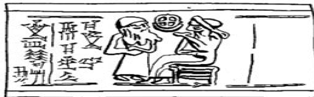
FIG. 2. ROLL LAPIS-LAZULI SEAL FROM SUSA

Arabian inscriptions have been found in Mesopotamia and at Koweit on the Arabian shore of the Persian gulf near the boundary of Iraq. 10 But the date of Himyaritic Minaean civilization in the Yemen cannot be reduced to a late period merely because their monuments do not begin before the first millen-