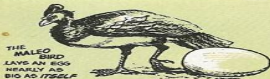
THE MALEO BIRD LAYS AN EGG NEARLY AS BIG AS ITSELF

THEY WERE SO IDENTICAL THAT THEY GREW WHISKER INITIALS 1895