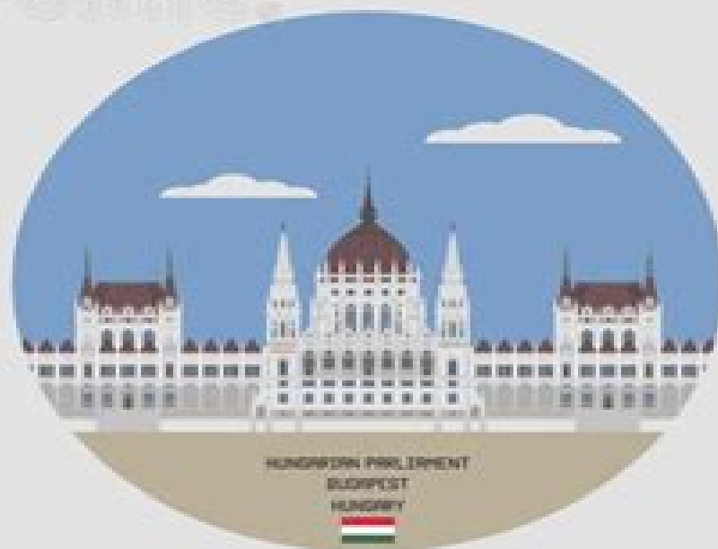
HUNGARIAN PARLIAMENT BUDAPEST HUNGARY