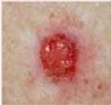
Basal cell carcinoma