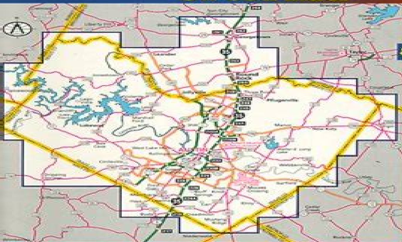
StreetFinder Coverage Area