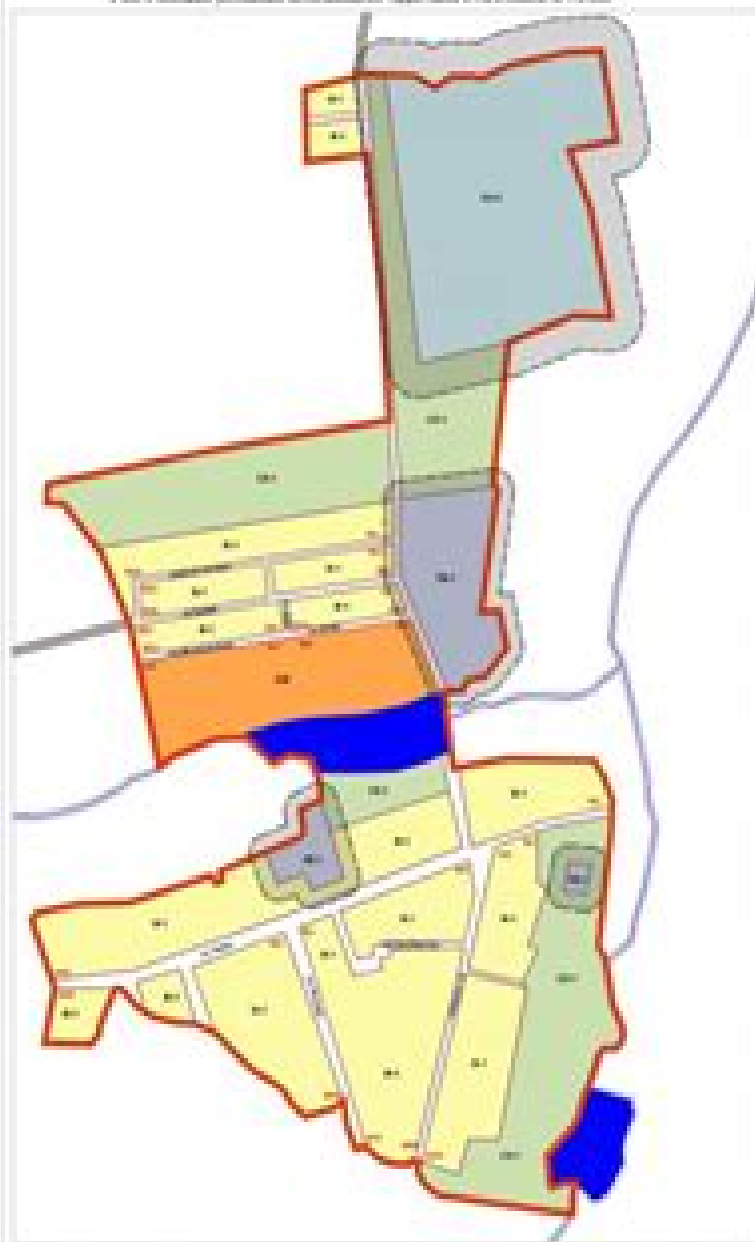
Карта градостроительного зонирования и зон с особыми условиями использования территории с. Толстиково М 1:5 000