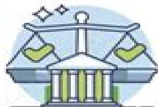
GOVERNANCE AND BASIC RIGHTS