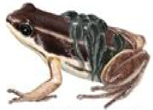
tadpoles on the back of a male Colostethus