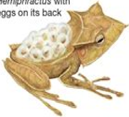
Hemiphractus with eggs on its back