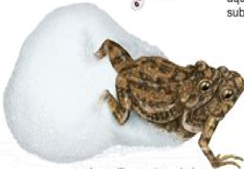
meringuelike nest made by amplectic pair of Physalaemus