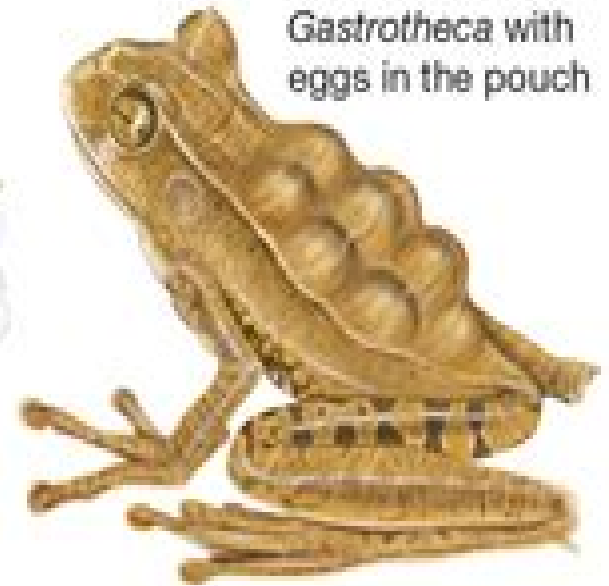
Gastrotheca with eggs in the pouch