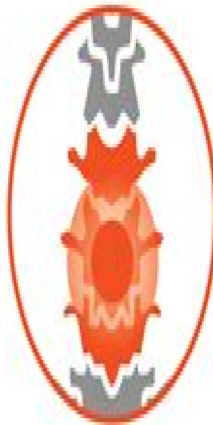
LOW BACK PAIN