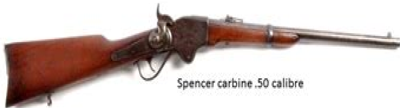
Spencer carbine .50 calibre