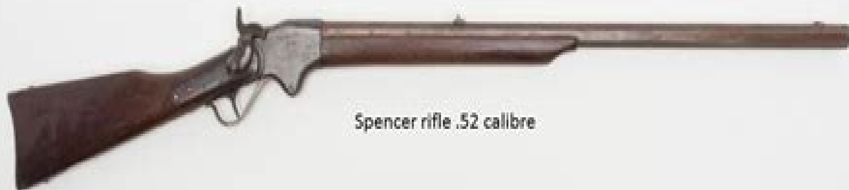
Spencer rifle .52 calibre