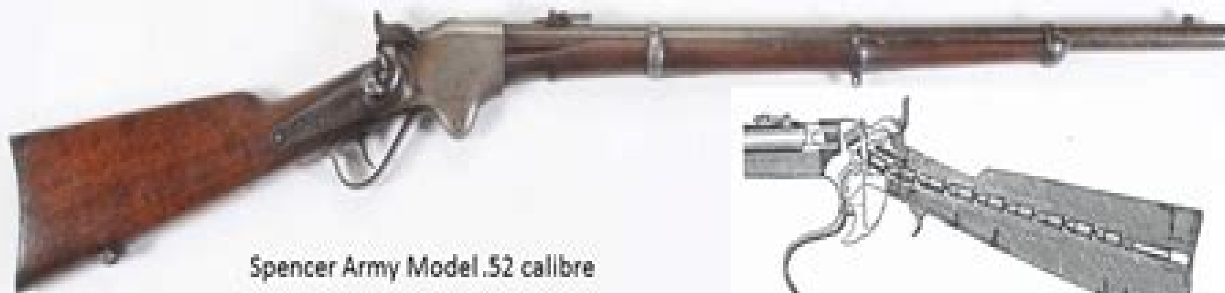
Spencer Army Model .52 calibre