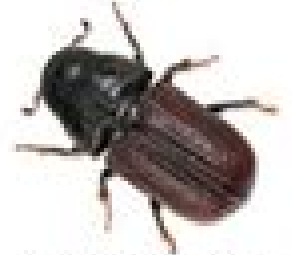
Mountain pine Beetle