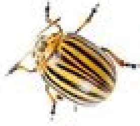
Colorado potato Beetle