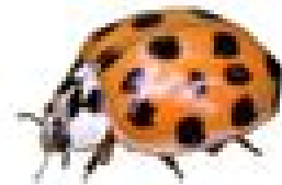
Asian lady Beetle