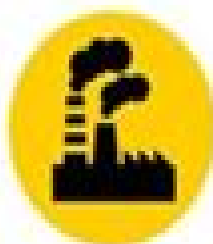
Volatile organic compounds