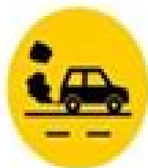
Traffic-related air pollution

Air pollution comes from a wide range of sources. These are divided into categories, which can help public health officials address air pollution by reducing its impact one group at a time: