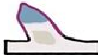
Blastema formation and outgrowth