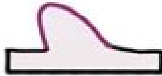
Bud outgrowth and patterning