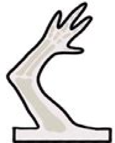
Re-differentiation and redevelopment