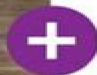
JASTUK M-CLASSIC 50x70