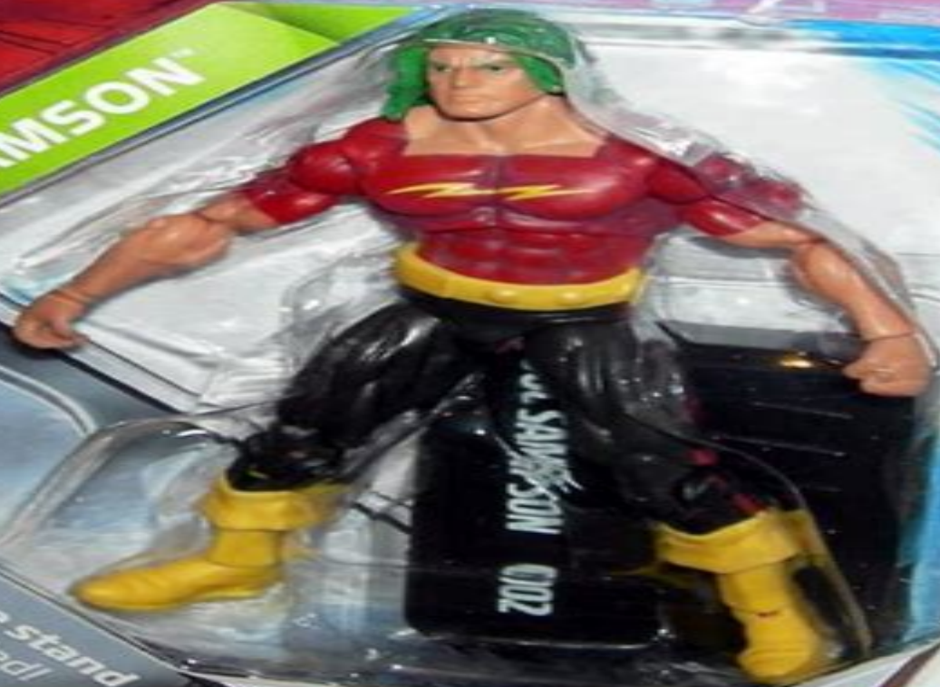
Figure stand Included!