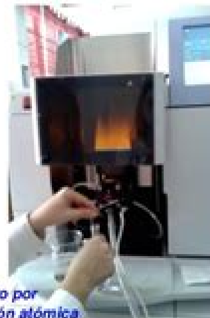
Determinación de un analito por espectroscopia de absorción atómica

Simultáneamente con la medida de la propiedad física, se hace necesario emplear reacciones químicas.