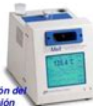
Determinación del punto de fusión

La operación de medida no cambia la composición química del sistema.