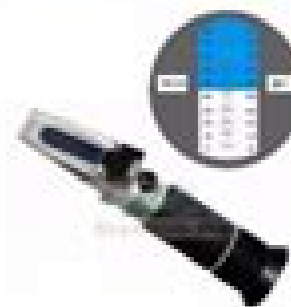
Medición de "Brix" en soluciones azucaradas

No es esencial la presencia de una rxn química.